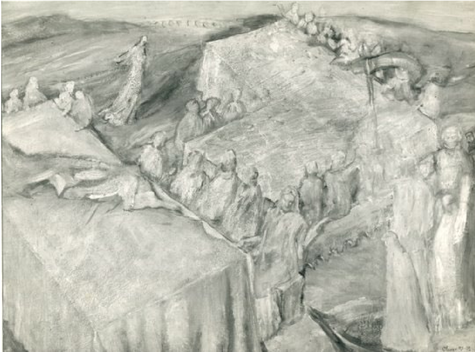
Figures at the table (a tribute to Magnasco), Acrylic on fiberboard, 70 x 120 cm, Moscow, 1970-72